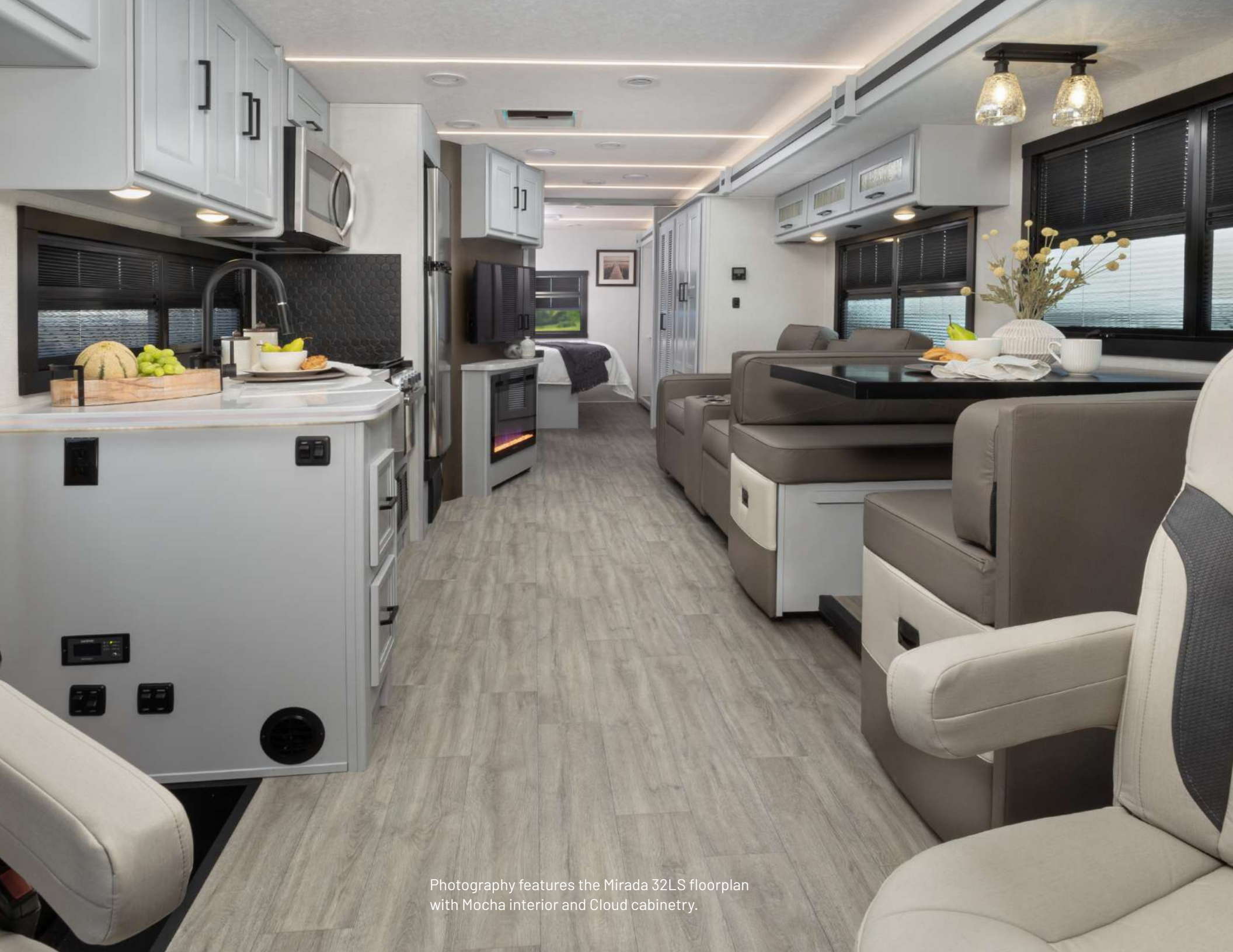
Photography features the Mirada 32LS floorplan with Mocha interior and Cloud cabinetry.