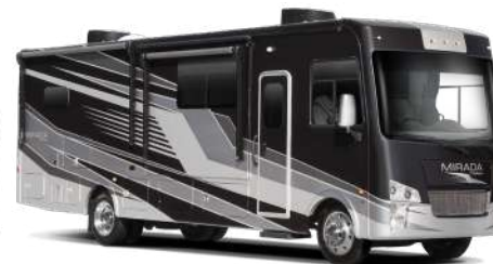
Full Body Paint – Graphite