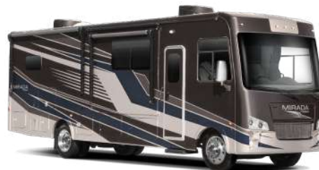
Full Body Paint – Glaucous