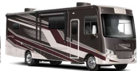
Full Body Paint – Scarlet