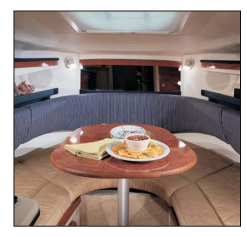
Comfortably appointed V-berth doubles as an attractive dining area with the addition of this burl-wood Formica® table.

Sea Ray Boats, 2600 Sea Ray Blvd., Knoxville, TN 37914. For information call 1-800-SRBOATS or fax 1-636-326-3282. Internet address: http://www.searay.com Note: Not all accessories shown in pictures or described herein are standard equipment or even available as options. Options and features are subject to change without notice. Not all model year boats may contain all the features or meet the specifications described herein. Confirm availability of all accessories and equipment with an authorized Sea Ray dealer prior to purchase. Printed in the U.S.A. October 2004 ©Sea Ray Boats.