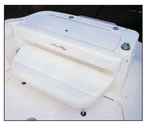
This versatile aft bench folds away when not in use, allowing easy access to the extra-large insulated fish box.