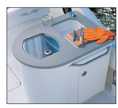
Attractive and functional, this optional bait-prep station features a recirculating live baitwell system with pull-out sprayer, cutting board, and convenient carry-on cooler.