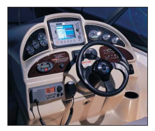
Newly designed dash boast handsome new tilt-steering wheel with black spokes and polished centerpiece plus a full complement of SmartCraft<sup>™</sup> diagnostic instruments.

The all-new 270 Amberjack offers the best of both worlds for sports-minded families—comfortable cruising plus an optional full-feature fishing package. The stylish cockpit includes versatile seating and built-in storage, while the spacious cabin below features a convenient galley and dinette, elegant V-berth and full-size head with vanity and shower.