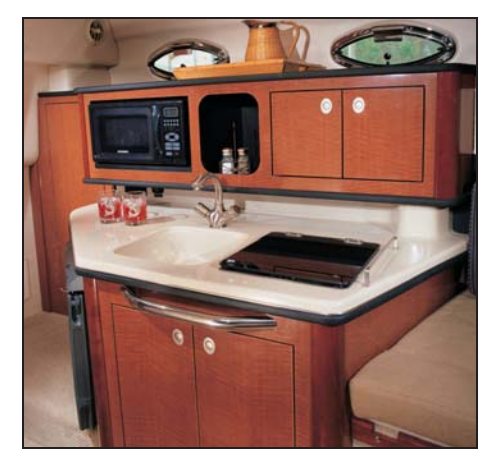
Rich, cherry Formica® cabinets add a touch of elegance to this well-equipped galley, which features microwave, refrigerator, and molded-in sink.