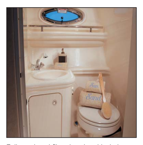
Fully enclosed fiberglass head includes VacuFlush® toilet plus shower and curtain, mirror, vanity and sink with plenty of storage below.