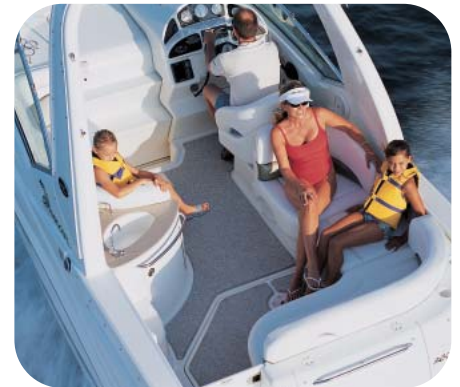
Comfort comes standard with this luxurious and open cockpit designed for sunning and entertaining.