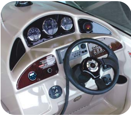
This handsome new black coral and burl control station is fully equipped with custom Sea Ray SmartCraft™ instruments.

The sleek new design is only one of the many premium upgrades we've made on this roomy new 260 Sundancer. Typical Sea Ray ergonomics designed throughout make this boat rival any other in its class. We've also added a translucent deck hatch with locks and sky screen cover, plus a transom storage compartment with gas-assisted lid. It's the best boat in its class, with all the extras you would expect from a much larger, more expensive cruiser.