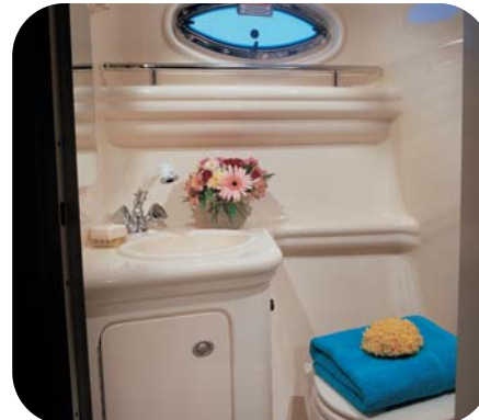
This comfortable head and shower compartment is fully enclosed and features a sink, vanity, and VacuFlush® head.