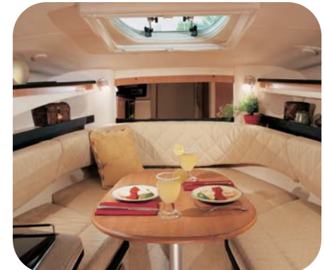
Rich textures and designer fabrics make this roomy V-berth attractive and comfortable.

Sea Ray Boats, 2600 Sea Ray Blvd., Knoxville, TN 37914. For information call 1-800-SRBOATS or fax 1-636-326-3282. Internet address: http://www.searay.com Note: Not all accessories shown in pictures or described herein are standard equipment or even available as options. Options and features are subject to change without notice. Not all model year boats may contain all the features or meet the specifications described herein. Confirm availability of all accessories and equipment with an authorized Sea Ray dealer prior to purchase. Printed in the U.S.A. June 2005 ©Sea Ray Boats. PUB030706