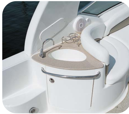
Elegant cockpit wet bar features Corian® countertop and stainless steel faucet.