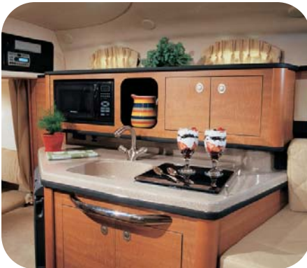
This tastefully appointed galley comes well equipped with a molded-in sink, dual-voltage refrigerator, microwave, and butane stove.