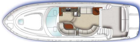
Upper Cabin/Cockpit Layout

Satellite Interface - Skymate Satellite Boat-Monitoring & Communication System w/8' Fiberglass Antenna & Stellar Satellite Communicator Module Sea Ray Navigator III Sonar/Fishfinder Module Sea Ray Navigator III Network Interface Cameras (Bilge & Cockpit)