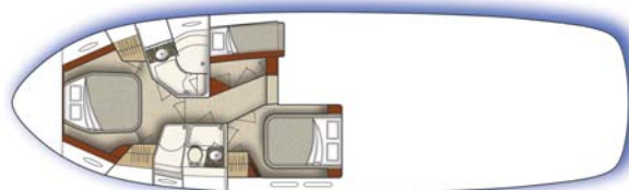
Lower Cabin Layout