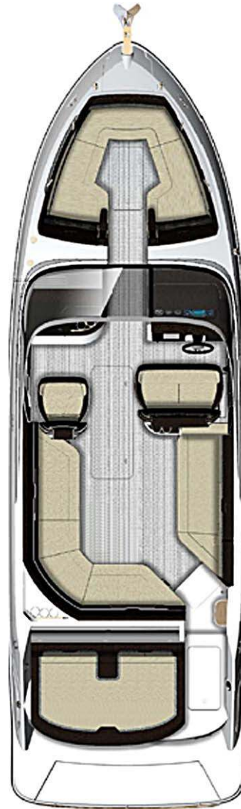
STANDARD SEATING PLAN