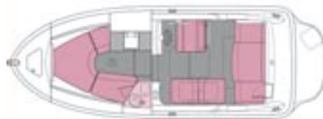
Optional Seating Plan