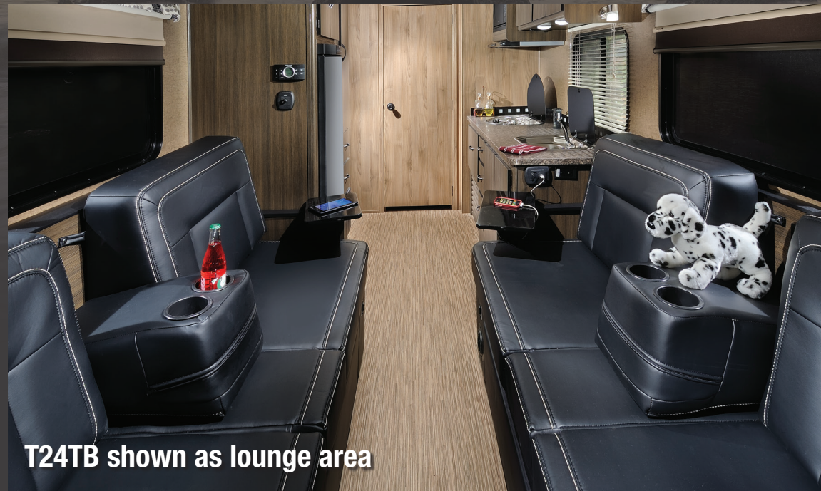
T24TB shown as lounge area

As one of the top selling brands in the nation, Coachmen has been providing generations a product they can rely on for over 50 years. That same dedication to quality and value is evident in the intelligently-designed Orion.