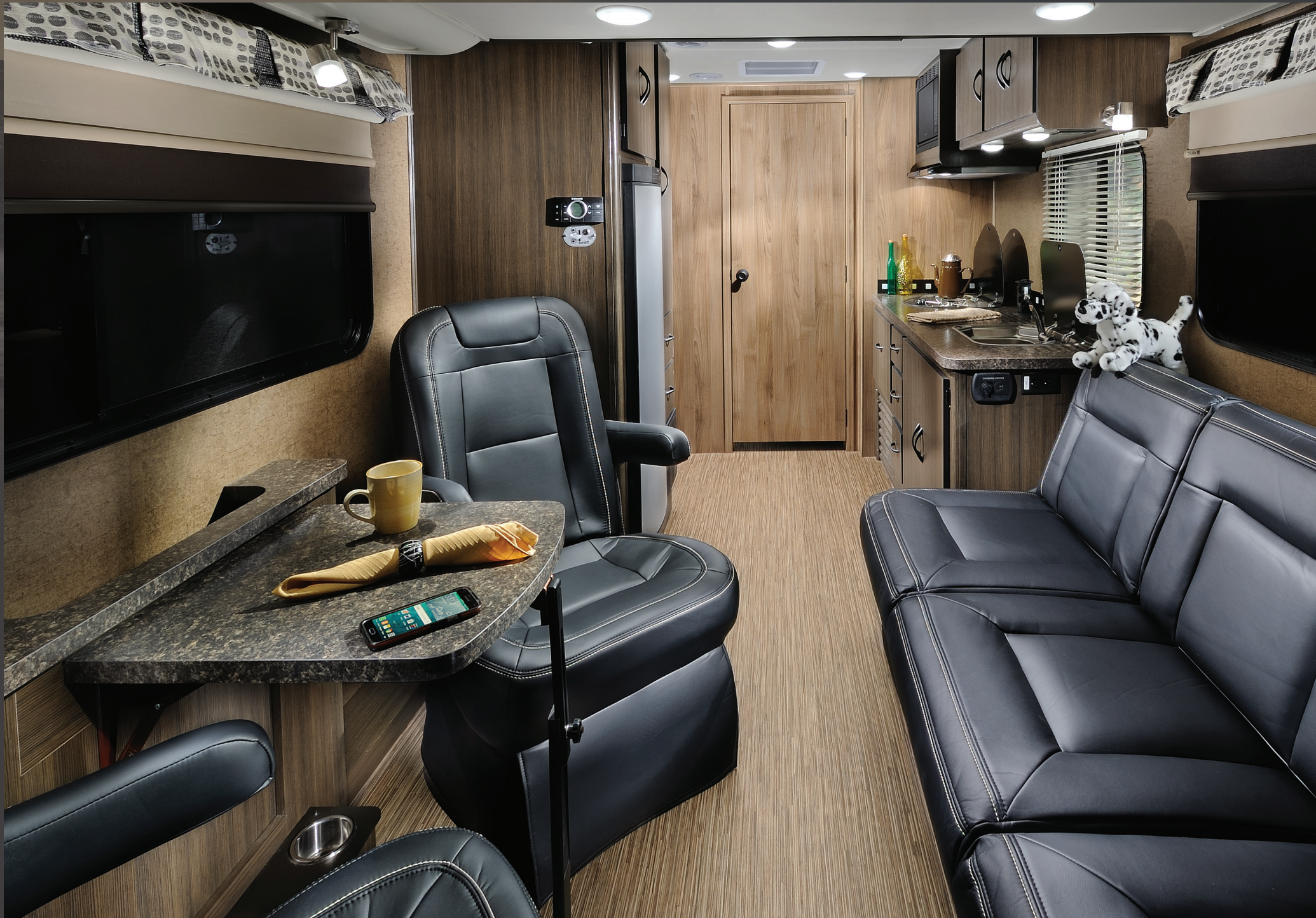
T24TB shown with Cobblestone décor