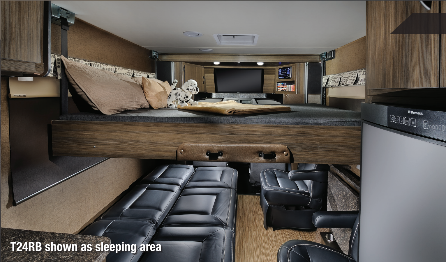
T24RB shown as sleeping area

60" x 80" Powered drop-down queen bed with bunk ladder • Luxury seating with integrated safety belts • Belted swivel chairs with flip-up table • Sofa converts to sleeping area • 32" LCD TV/DVD/speakers/subwoofer