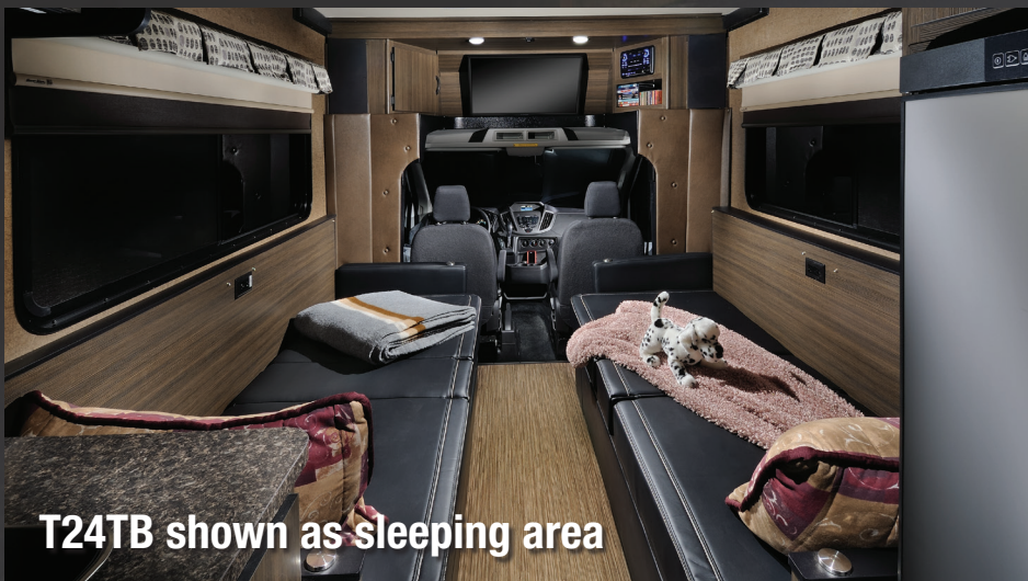
T24TB shown as sleeping area

Backup & side view monitor • Tilt steering wheel • Dash air conditioning • Exterior mirrors with heat & remote