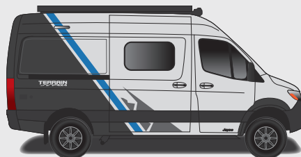
Aztec Partial Paint (Silver Van Only)