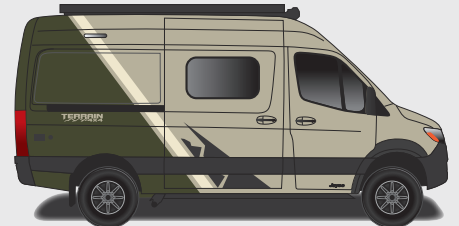
Forest Glade Partial Paint (Sandstone Van Only)