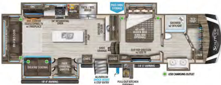
372WB UYW 1 HITCH 1 GVWR LENGTH 1 HEIGHT CAPACITY 372WB-R 13,950 2,800 16,800 41' 4" 13' 5" 93 100 50