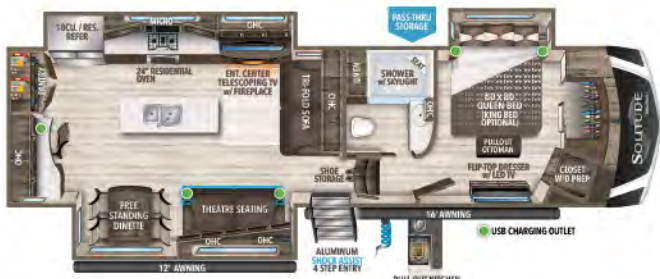
345GK UYW 1 HITCH 1 GVWR LENGTH 1 HEIGHT CAPACITY 345GK-R 13,320 2,604 16,800 37' 2" 13' 5" 93 100 50