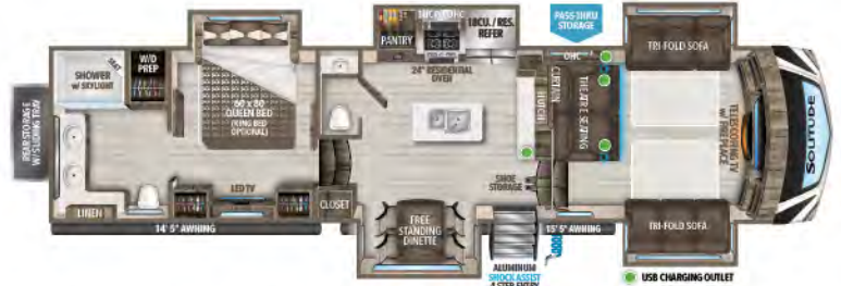
380FL UYW 1 HITCH 1 GVWR LENGTH 1 HEIGHT CAPACITY 380FL-R 14,866 3,052 16,800 41' 5" 13' 5" 93 106 106