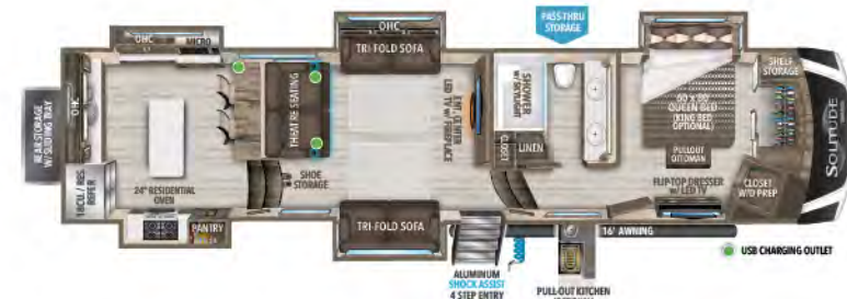
390RK UYW 1 HITCH 1 GVWR LENGTH 1 HEIGHT CAPACITY 390RK-R 14,562 2,794 16,800 41' 5" 13' 5" 93 106 53