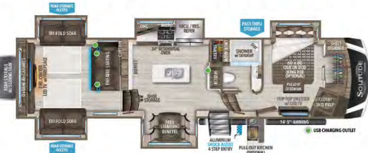
375RES UYW 1 HITCH 1 GVWR LENGTH 1 HEIGHT CAPACITY 375RES-R 14,200 2,900 16,800 41' 4" 13' 5" 93 100 50