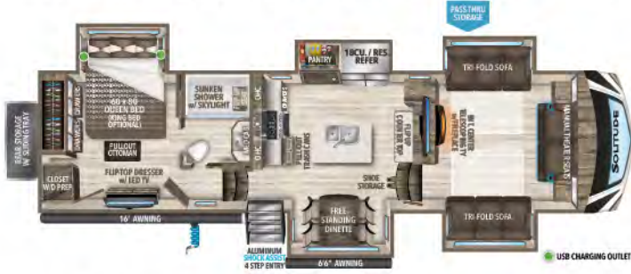
346FLS UYW 1 HITCH 1 GVWR LENGTH 1 HEIGHT CAPACITY 346FLS 14,222 3,096 16,800 37' 11" 13' 5" 93 100 50