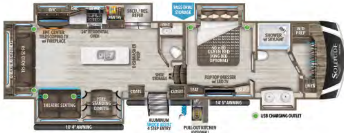
373FB UYW 1 HITCH 1 GVWR LENGTH 1 HEIGHT CAPACITY 373FB-R 13,950 2,800 16,800 41' 4" 13' 5" 93 100 100