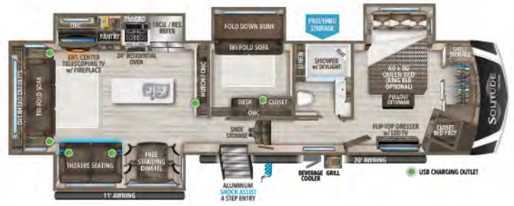
378MBS UYW 1 HITCH 1 GVWR LENGTH 1 HEIGHT CAPACITY 378MBS-R 14,344 2,686 16,800 40' 2" 13' 5" 93 100 50