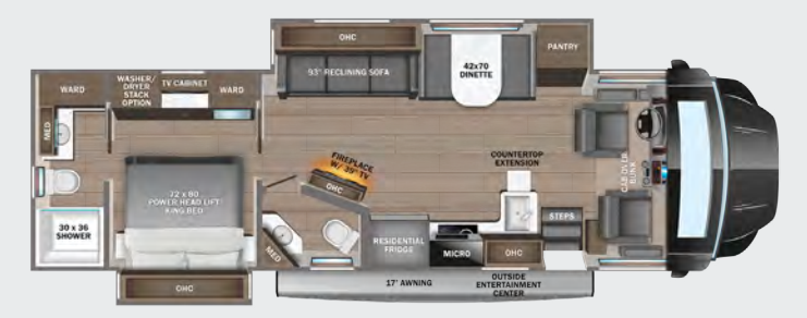
37L OPTIONS: A, B