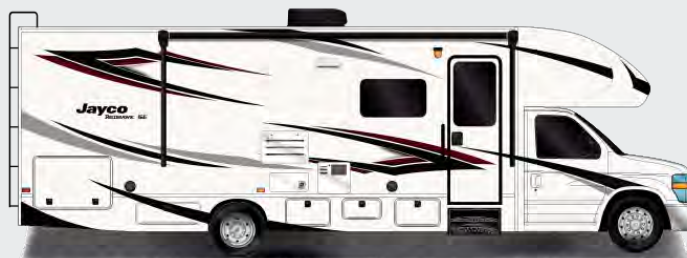
Standard Graphics Package