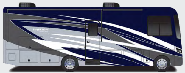
Oriole Full-Body Paint