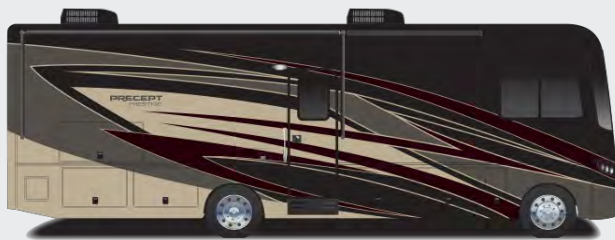
Warbler Full-Body Paint