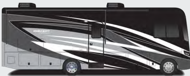
Chickadee Full-Body Paint