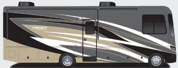
Wren Full-Body Paint