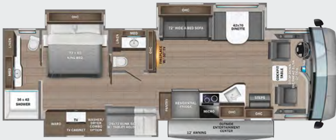
36B OPTIONS: A, B