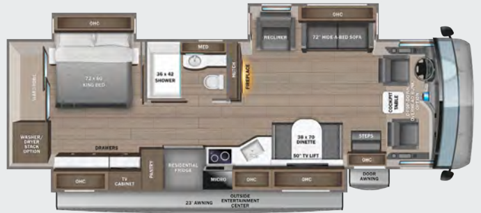
36H OPTIONS: A, B, D