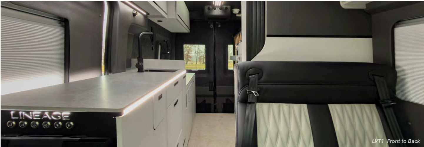
LVT1 Front to Back