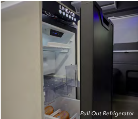
Pull Out Refrigerator