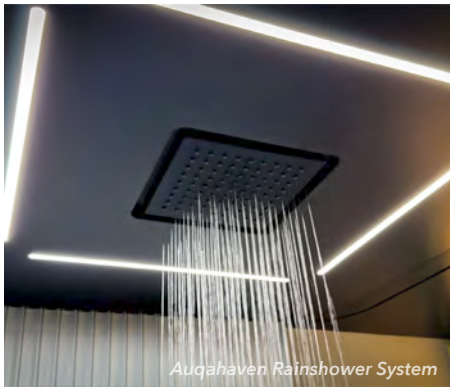
Aqualaven Rainshower System