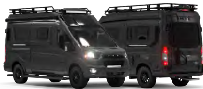
CARBONIZED GRAY SAFARI RACK - STANDARD