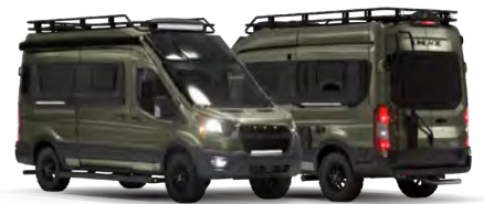
WILD GREEN SAFARI RACK - STANDARD