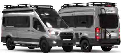
AVALANCHE GRAY SAFARI RACK - STANDARD