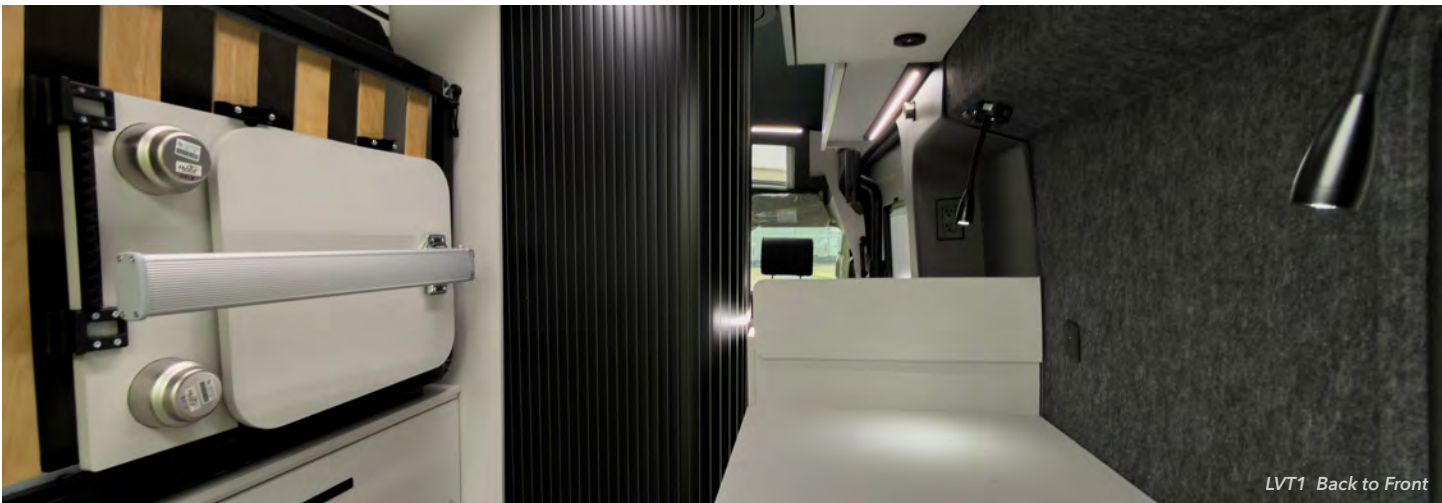
LVT1 Back to Front