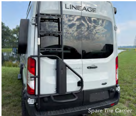
Spare Tire Carrier