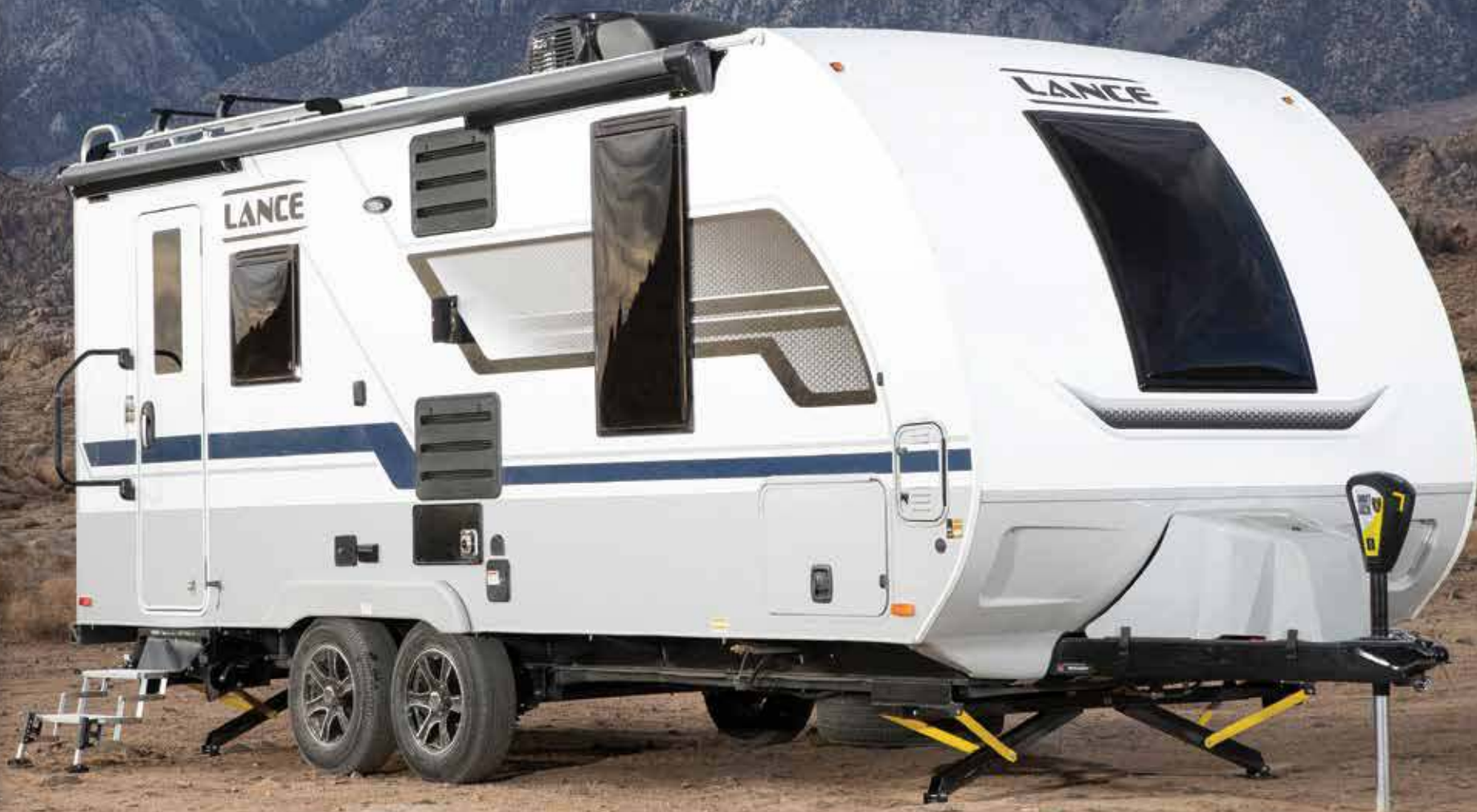
Model 1995 Shown W/Optional Equipment