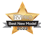
Cutting Edge Design