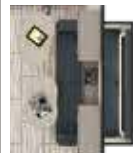
Optional Slide-Out w/Couch Bed Size 36" x 59"