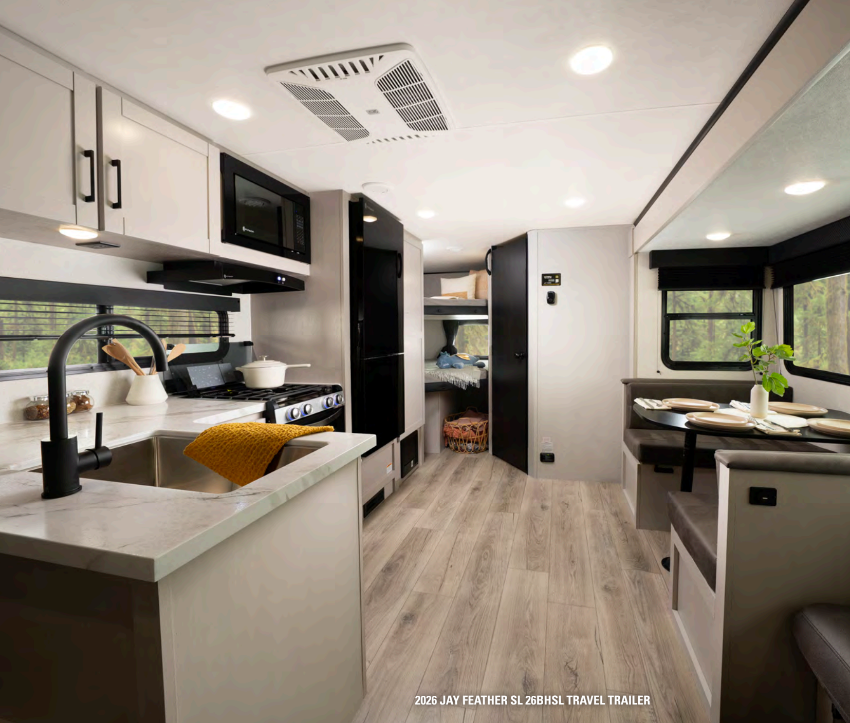
2026 JAY FEATHER SL 26BHSL TRAVEL TRAILER