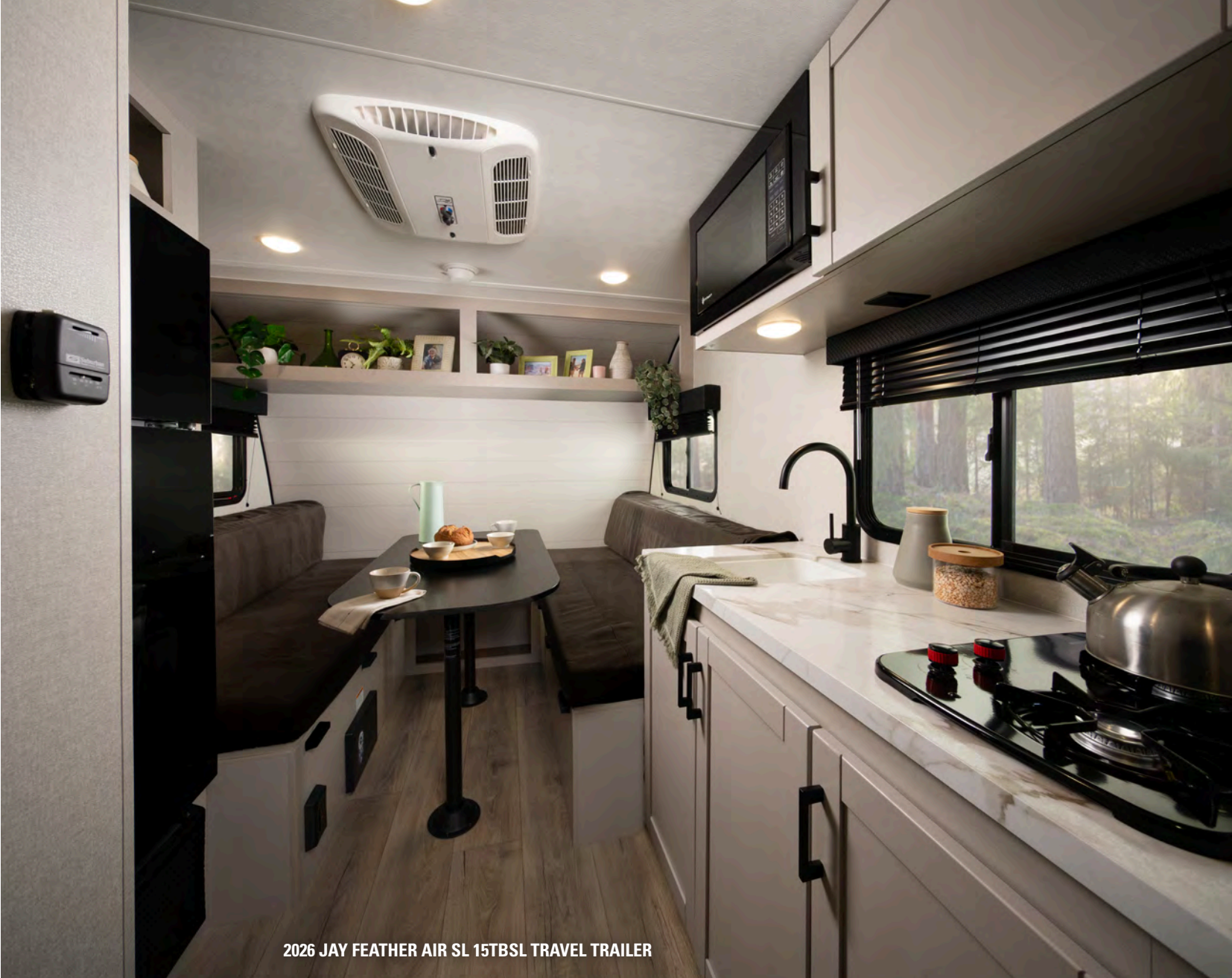
2026 JAY FEATHER AIR SL 15TBSL TRAVEL TRAILER