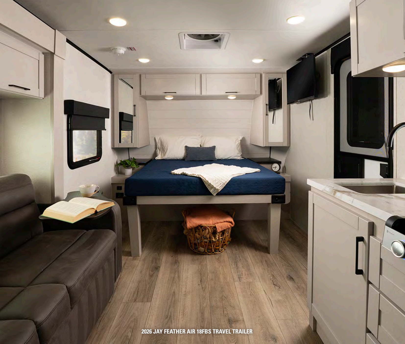
2026 JAY FEATHER AIR 18FBS TRAVEL TRAILER