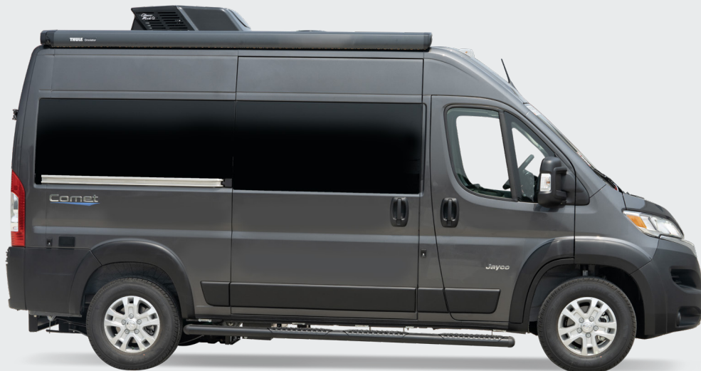
Granite Van (Not Pictured: Silver Van)