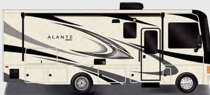
Standard Graphics Package