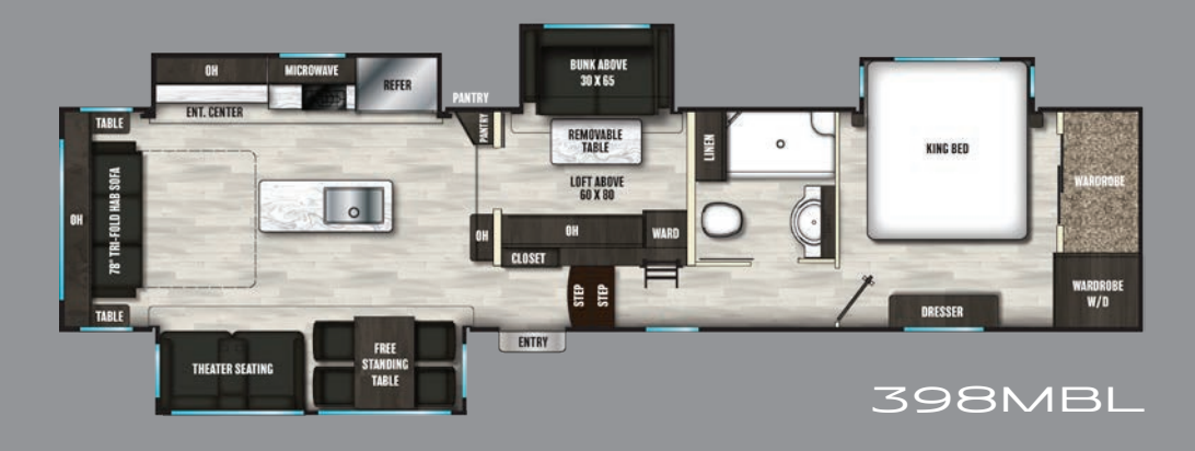
42'-2", 13,155# (UVW)