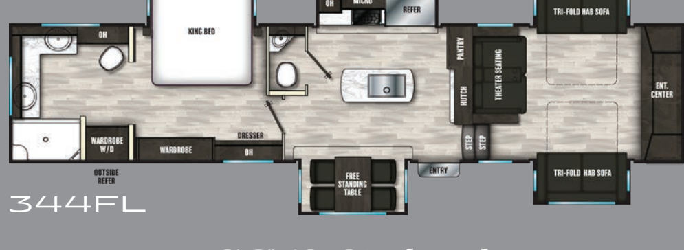
42'-2", 12,789# (UVW)