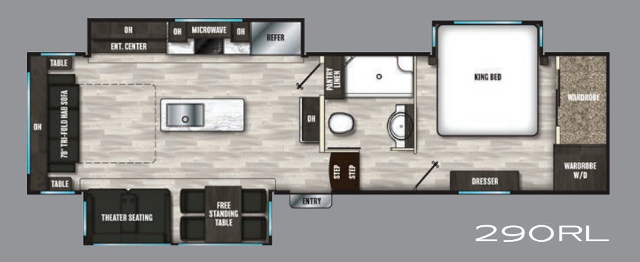
36'-4", 11,472# (UVW)