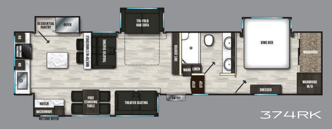
42'-2", 13,020# (UVW)