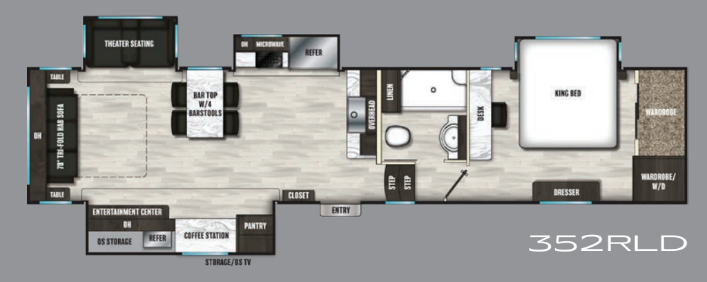
42'-2", 12,428# (UVW)