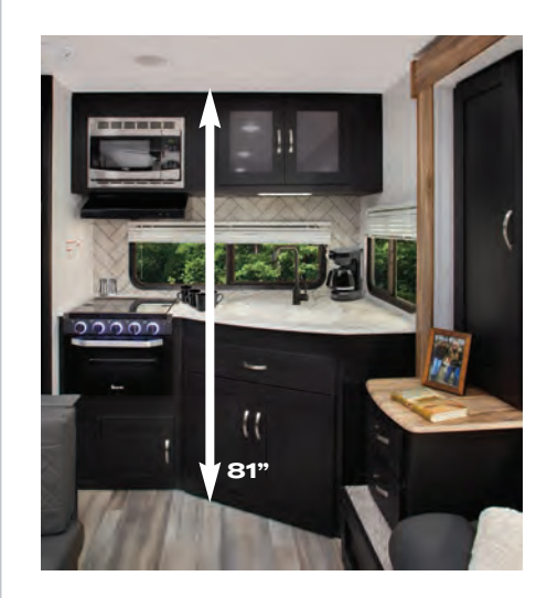
An 81" interior height throughout results in taller slide rooms and 14" overhead kitchen cabinet storage space.