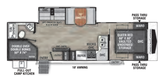
287 BHDS / Exterior Length 32' 10"