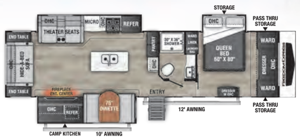
324 RLDSLE / Exterior Length 36' 10"