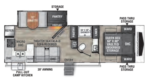
274 RKS / Exterior Length 31' 10"