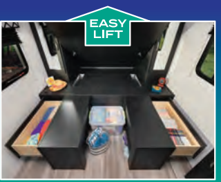
Pack up and go! Easy to lift vaulted queen bed storage includes drawers and under drawer shoe cubbies. (Not available on slide out beds and SE models.)