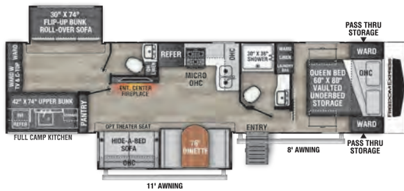
326 BHDSLE / Exterior Length 36' 10"