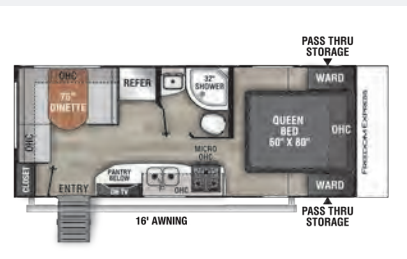
20 SE / Exterior Length 24' 6"