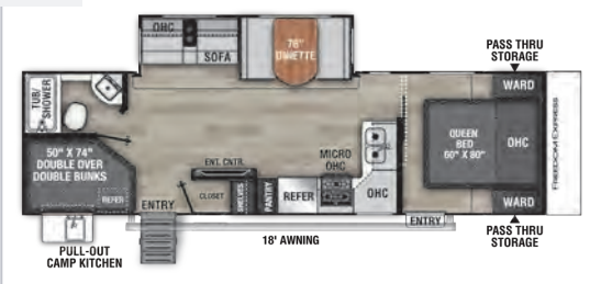
28.7 SE / Exterior Length 32' 10"