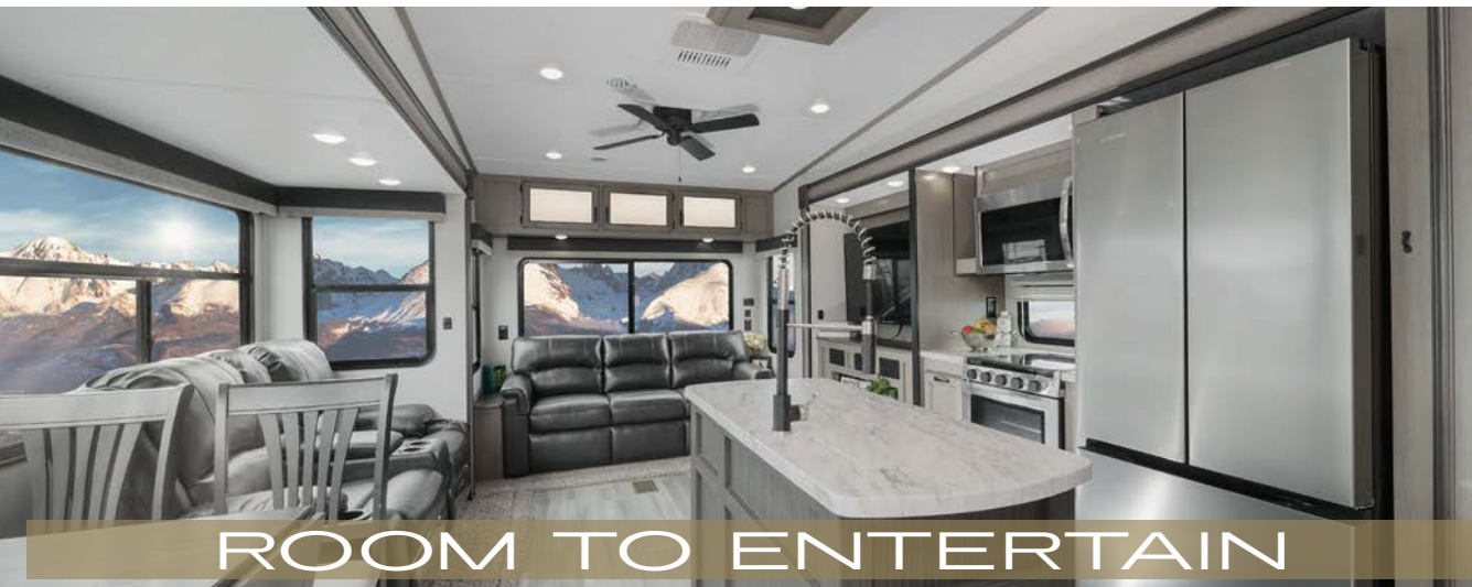
ROOM TO ENTERTAIN