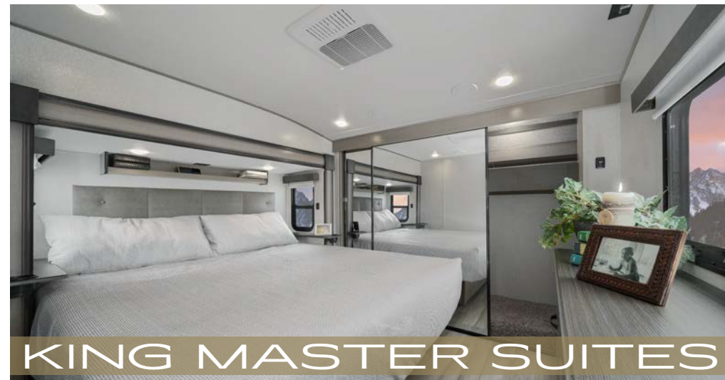
KING MASTER SUITES