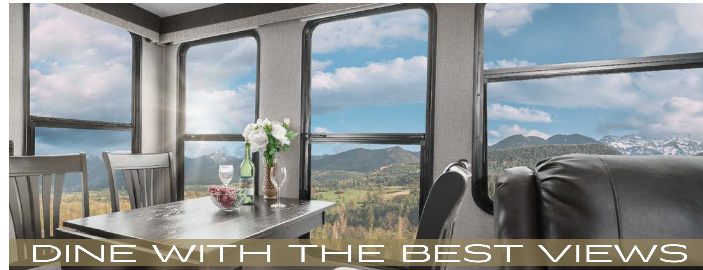
DINE WITH THE BEST VIEWS