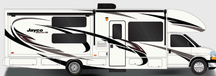
Standard Graphics Package