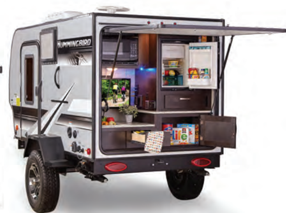
Outfitted with optional roof rack system and Thule® awning