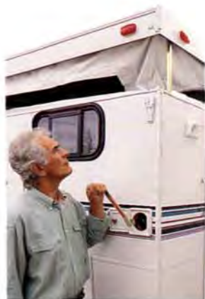
"No Tuck" Tent Automatically Pulls In As Roof Is Cranked Down

Sportster Series or Jay Hawk Series— Choose the Exterior Graphics that Best Match Your Truck