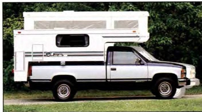
Sportster Roof Down: Less Wind Resistance; Sportster Roof Up: Lots of Headroom at Campsite

FRONT COVER: The 9-1/2' Sportster, at Right, and the Jay Hawk Series 1050 ECO