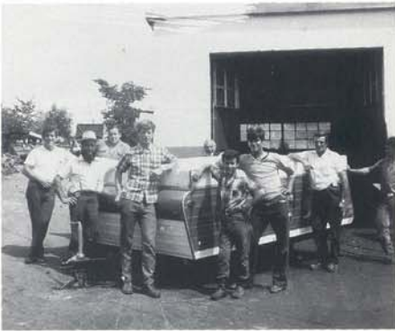
Jayco employees of 1968 with one of the first fold-downs to roll off the assembly line.