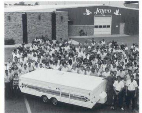
Today, Jayco employees number over 500 and contribute to making Jayco one of the top five manufacturers of towable RVs in the U.S.

First and foremost is the company’s commitment to quality—a commitment made at Jayco’s founding. No doubt it took its precedence in the respect for craftsmanship held by the Amish farmers of the region. Many of those farmers lent their skills to the company in its early days. Many Amish craftsmen are employed by the company today. At any rate, now you