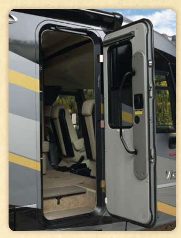
Threshold RV Door The Via features the most advanced entrance door in the industry.

You've never seen a motor home door like this before. Inspired by airplane technology, the new Threshold RV Door™ features dual seals, dual latches and hidden hinges that reduce wind and road noise and provide a secure seal. The interior and exterior handles are set at separate, ideal heights for entering and exiting. A built-in screened window provides ventilation with the door closed.