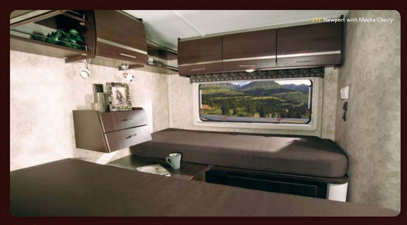
Flex Bed System One queen bed or two twin beds? It's your choice in the Via.

The Via 25T introduces the Flex Bed system, allowing you to customize the bedroom depending on your sleeping preference. The bed sleeps as two twin beds or you can choose to add the available Flex Bed kit which allows you to easily convert them into a queensized bed. Storage is abundant in either configuration with upper cabinets and large drawers beneath the beds. The 25T also features a 19" LCD TV in the bedroom. A classic queen bed comes standard in the 25R.