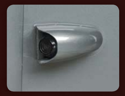
Side-View Cameras Side-view cameras activate with the turn signals for easier turn navigation.