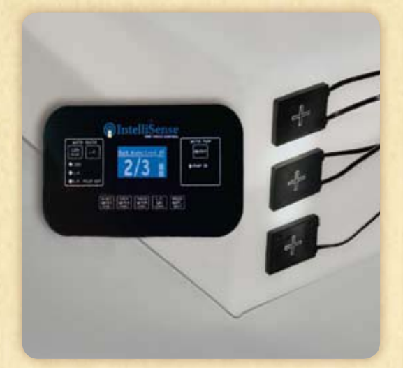
TRUELEVEL The TrueLevel holding-tank monitoring system uses sonar technology to read liquid levels from outside the tank. There are no probes to corrode or clog, just accurate readings time after time.