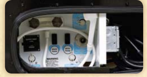
Wash Station Rinse off dusty items outside the coach.