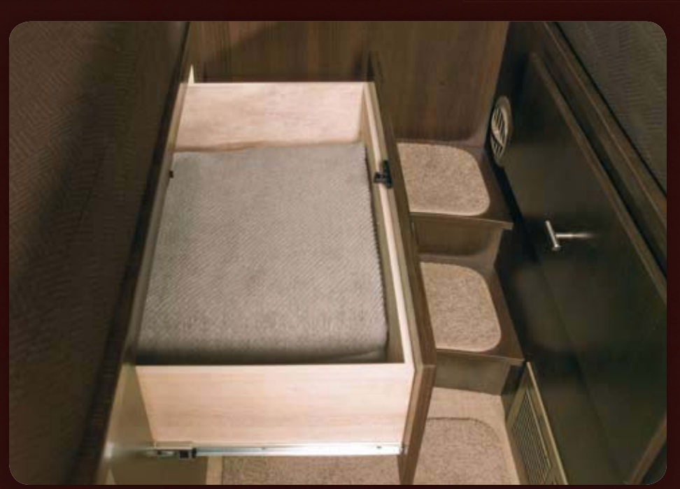
Storage Drawers A storage drawer beneath each twin bed holds extra linens.