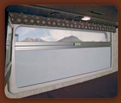
Adjustable Shades Built-in shades rise from the window base so you can maintain privacy while enjoying a fresh breeze.