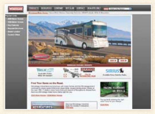
GoWinnebago.com Watch key feature videos, take interactive tours, see the latest promotional offers and a whole lot more at GoWinnebago.com.

In the living area you'll find a 26" (25T) or 32" (25R) LCD TV. The 26" TV is mounted on a unique bracket that allows for easy viewing from multiple angles. Beautiful cabinetry houses plenty of storage space while vinyl flooring provides an easy-to-clean surface throughout the coach. The stereo system features a CD/DVD player—the perfect excuse to relax in the UltraLeather furniture that comes standard in every Via.