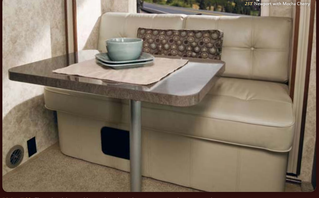
Dining Table The pedestal dining table provides a classic dining experience and stows away when not in use.