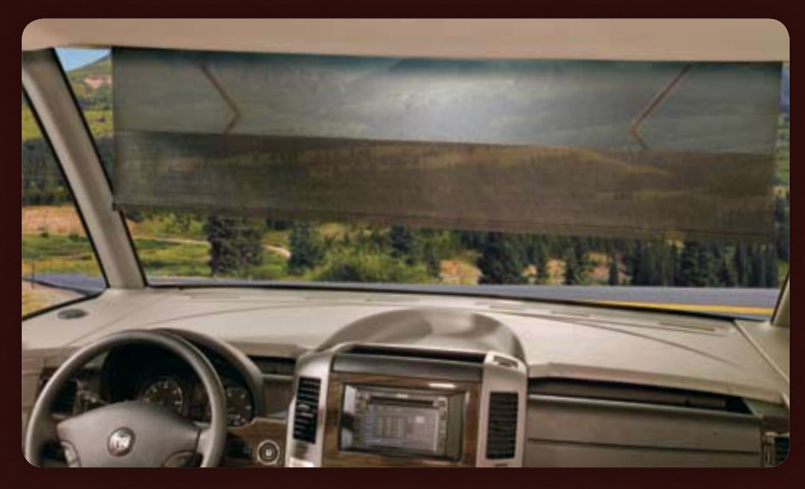
Sunvisor A powered sunvisor drops down at the touch of a button.

The Jensen™ radio features an LCD touchscreen that doubles as the monitor for the side and rearview cameras. You can also upgrade to the Sirius® satellite radio and enjoy over 120 digital channels and a complimentary six-month subscription.