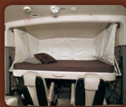
StudioLoft The exclusive StudioLoft drops down from the ceiling to create a front bedroom.