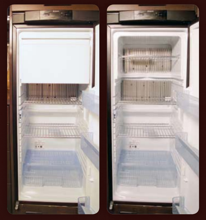
Removable Freezer The freezer compartment can be removed from the refrigerator to create more space and cold-storage flexibility.