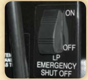
LP Tank Switch The LP tank has a remote switch for simple, safe operation.