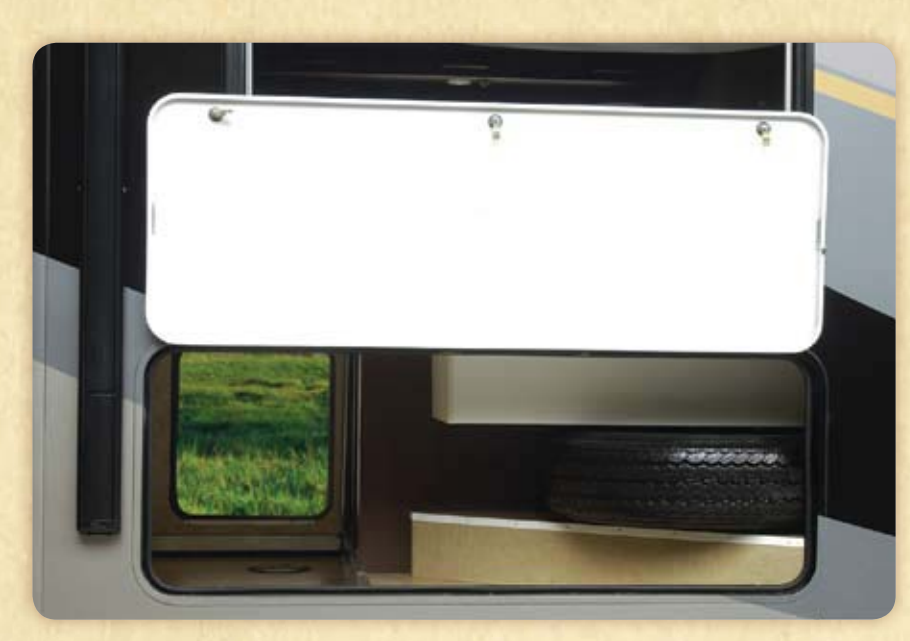
Storage Bring more from home with over 87 cubic feet of storage in the 25T.