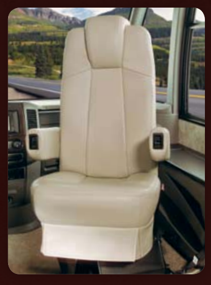
Cab Seats The UltraLeather seats have multiple adjustment points to keep you comfortable on the road.