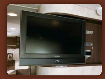
TV Versatility Innovative bracketing for the 26" TV in the 25T slides for optimal viewing even when the slideroom is not extended.