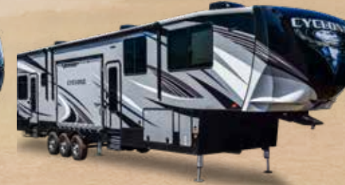
Blue Standard Graphics