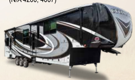
Champaign Full Body Paint