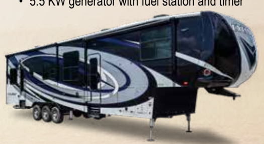
Blue Full Body Paint