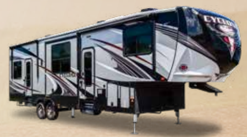
Burgundy Standard Graphics