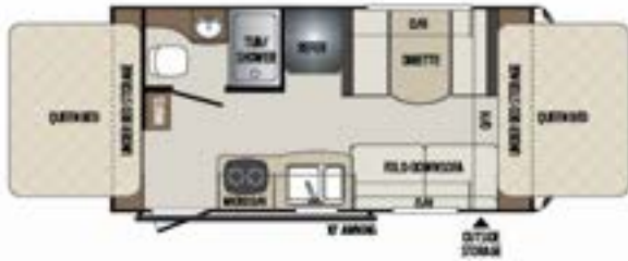
1650EX | Two-tent expandable Weight: 3420 LBS. | Length: 19' 6"