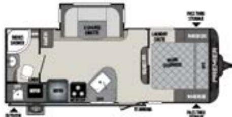
22RBPR | Rear bath, outside kitchen Weight: 4972 LBS. | Length: 26' 11"