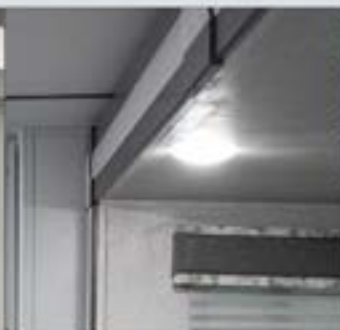
Interior LED Lights LED lighting draws less energy than regular bulbs and gives off less heat.