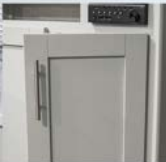
Heavy Duty Hidden Hinge Hidden hinges on the cabinets offer a residential look and a high-end feel.