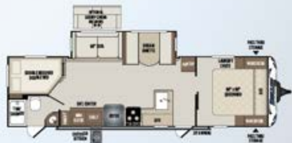
290BHS | Bunkhouse, outside kitchen Weight: 5785 LBS. | Length: 33' 9"