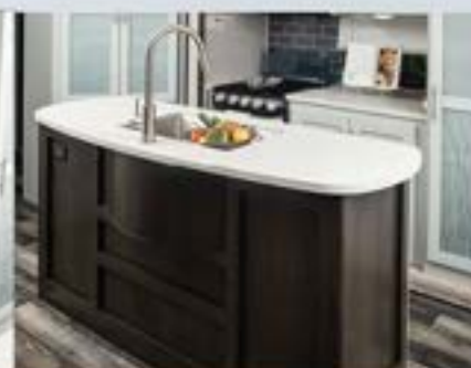
Island Kitchen with Solid Surface Countertops Island kitchen provides ample countertop space for meal preparation and other activities.