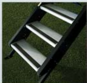
Ultra-Stable and Secure MORryde® Step Above™ Steps Ultra-stable and secure MORryde® Step Above™ steps with Keystone kick plate