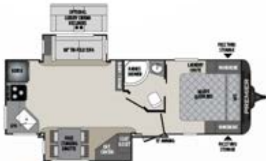
24RKPR | Rear kitchen, two slides Weight: 5563 LBS. | Length: 29' 6"