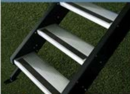
MORryde® StepAbove™ (Premier only) Ultra-stable and secure entry steps with Keystone kickplate.

Easier towing and innovative features designed to minimize stress and maximize your camping fun.