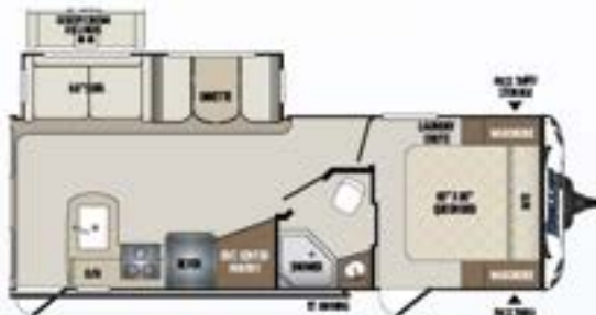
269RLS | Rear living, two entries Weight: 5449 LBS. | Length: 32' 5"