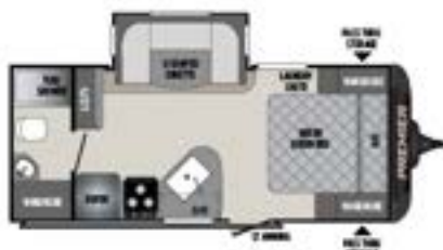
19FBPR | Rear bath, one slide Weight: 4353 LBS. | Length: 24' 3"