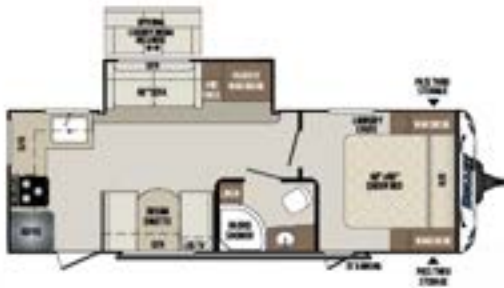
248RKS | Rear kitchen, one slide Weight: 5148 LBS. | Length: 29' 10"