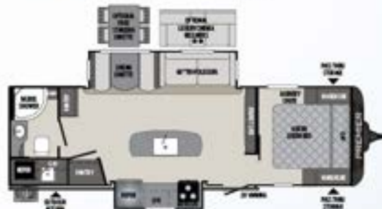
26RBPR | Rear bath, island kitchen Weight: 6121 LBS. | Length: 32'