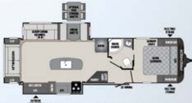
30RIPR | Rear living room, island kitchen Weight: 6870 LBS. | Length: 35' 11"