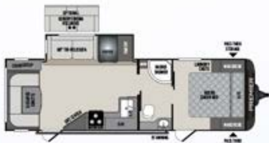
26UDPR | Rear dining, one slide Weight: 5525 | Length: 30' 11"