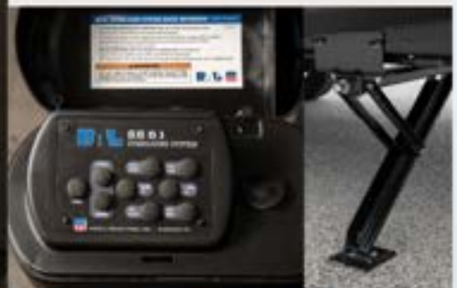
Norco™ Stabilization System (Premier only) Press OK and walk away! Electric jacks with large footpads and five points of contact quickly and consistently level and stabilize your RV.