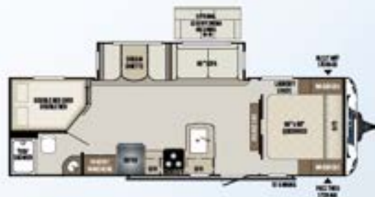
273BHS | Bunkhouse, one slide Weight: 5365 LBS. | Length: 31' 5"