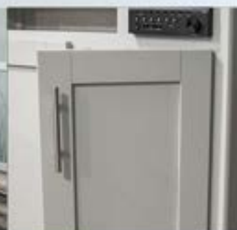
Hidden Hinges Hidden hinges on the cabinets offer a residential look and a high-end feel.