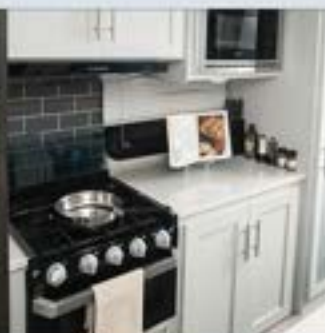
Furrion® Kitchen Appliances Furrion® flush-mounted glass cooktop and low-profile hood vent with stainless steel microwave