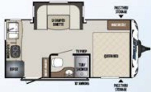
1750RK | Rear kitchen w/dinette slide Weight: 3595 LBS. | Length: 20' 4"