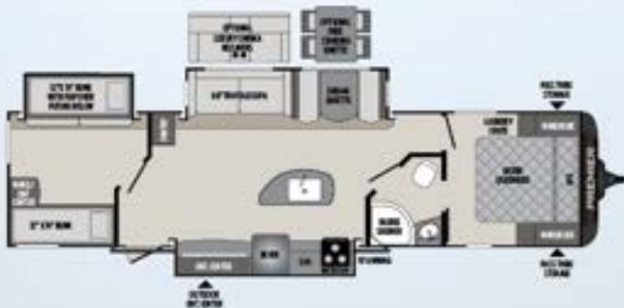
34BIPR | Bunkhouse, three slides Weight: 7285 LBS. | Length: 38' 1"