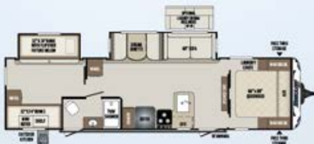
308BHS | Bunkhouse, two slides Weight: 6397 LBS. | Length: 36'