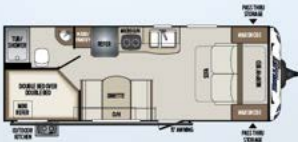
2200BH | Bunkhouse w/outside kitchen Weight: 4110 LBS. | Length: 25' 4"