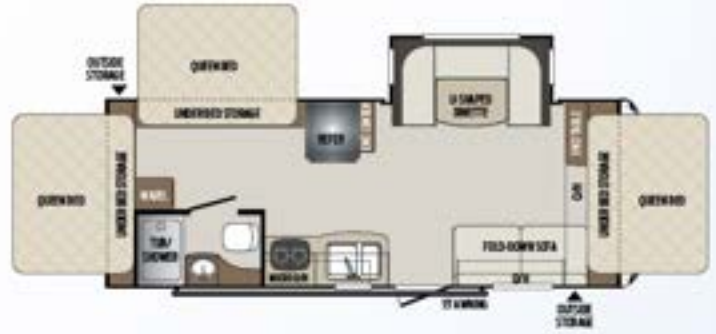
2190EX | Three-tent expandable w/dinette slide Weight: 4480 LBS. | Length: 24' 11"