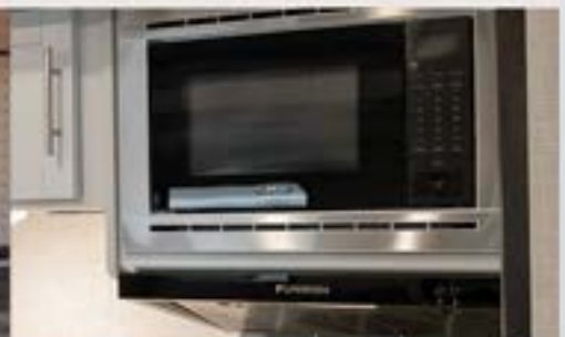
Furrion® Stainless Steel Kitchen Appliances Chef-inspired appliances that give you the perfect blend of performance, precision and style.