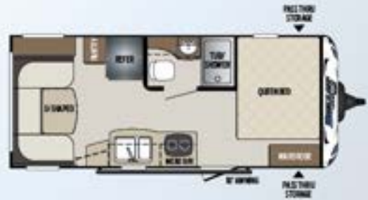
1900RD | Rear dinette, no slides Weight: 3360 LBS. | Length: 21' 11"