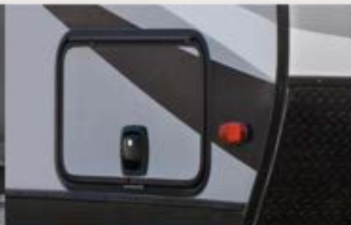
Slam Latch Baggage Doors (n/a Crossfire) Durable and convenient, these latches lock with just a slam of the baggage door, providing you with ultimate peace of mind that your valuables are secure.