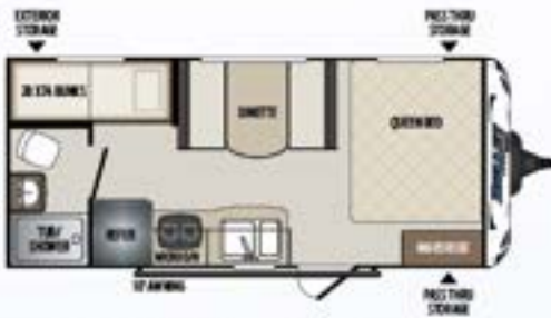
1700BH | Bunkhouse, single axle Weight: 3355 | Length: 21' 4"