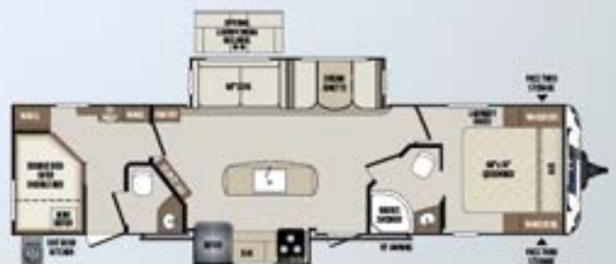
330BHS | Bunkhouse, 1 and 1/2 baths Weight: 6981 LBS. | Length: 37' 8"