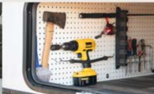
Pegboard Lined Pass-Through Storage (n/a Crossfire) Easily organize, stow and access tools, fishing equipment and other camping gear.