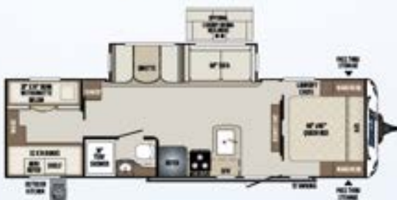
287QBS | Quad bunkhouse, outside kitchen Weight: 5840 LBS. | Length: 33' 10"