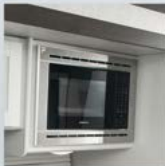
Stainless Steel Microwave Stainless steel microwave adds to the modern feel of the bright interior.