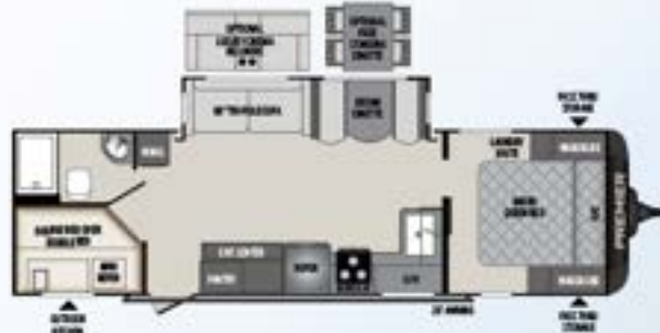
29BHPR | Bunkhouse, outside kitchen Weight: 5985 LBS. | Length: 33' 4"