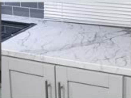
Continuous-Edge Kitchen Countertops Ultra-durable Whitewater™ continuous-edge countertops add a clean, modern touch to the kitchen area.