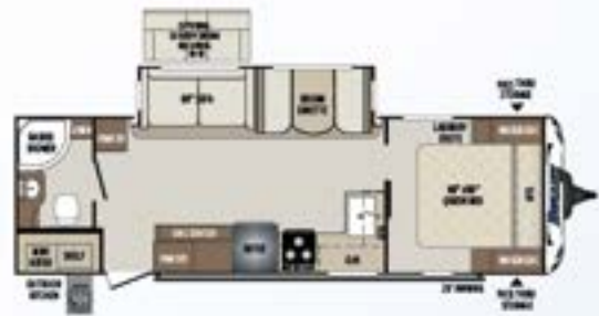
261RBS | Rear bath, outside kitchen Weight: 5465 LBS. | Length: 31'