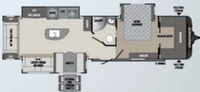
34RIPR | Rear living room, bed slide Weight: 7495 LBS. | Length: 38' 3"