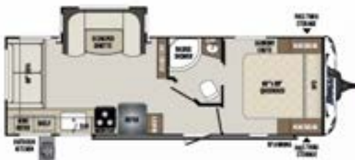
257RSS | Rear sofa, one slide Weight: 5158 LBS. | Length: 29' 11"