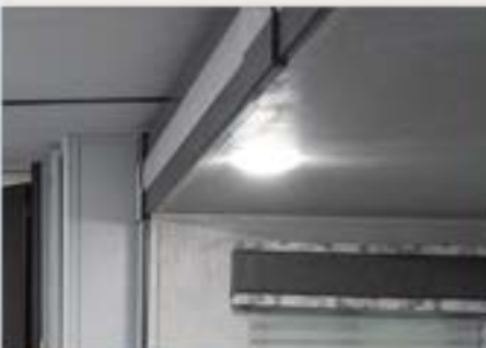
LED Interior Lighting One of the most energy-efficient and rapidly-developing lighting technologies, quality LED light bulbs last longer and are more durable.