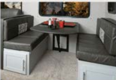
Dream Dinette (n/a Crossfire) No more table legs getting in the way! Makes for easy setup and easily converts into a bed.