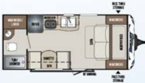
1800RB | Rear bath w/murphy bed Weight: 3310 LBS. | Length: 21' 4"