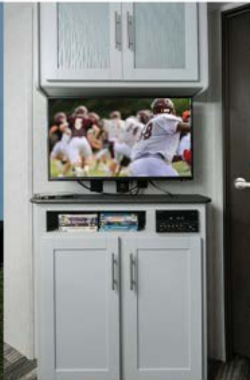
State-of-the-art Entertainment Center (n/a Crossfire) With 32" flat panel TV, Bluetooth-enabled AM/FM/CD/DVD with auxiliary stereo input.