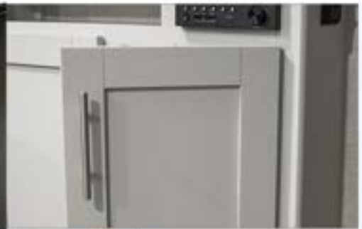
Heavy Duty Hidden Hinges Hidden hinges streamline Bullet's cabinet design for a high-end residential look and feel.