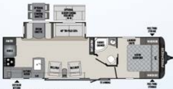
29RKPR | Rear kitchen, one slide Weight: 6172 LBS. | Length: 34' 5"