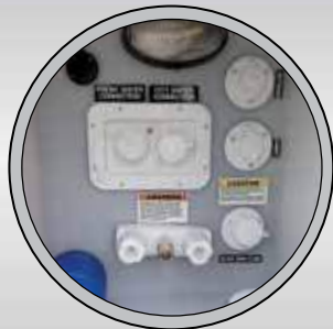
UNIVERSAL DOCKING CENTER