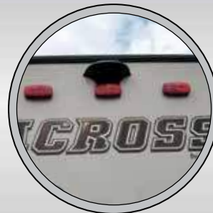
BACK UP CAMERA PREP