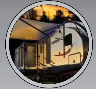
LED LIT POWER AWNING