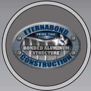
EXCLUSIVE ETERNABOND CONSTRUCTION