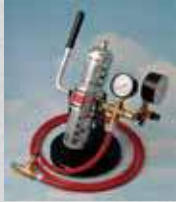
Seek-A-Leak Pressure Test

Prime Time Manufacturing is proud to be recognized as an industry leader in value, reliability, and overall quality by the Recreational Vehicle Dealers Association. We are committed to "A Higher Standard" in design, construction, testing, and customer service. Check us out — we know you'll be impressed!