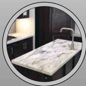
SOLID SURFACE COUNTERTOPS