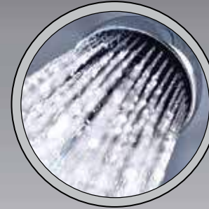
18 GPH DSI WATER HEATER