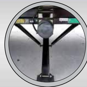
ELECTRIC STABILIZER JACKS