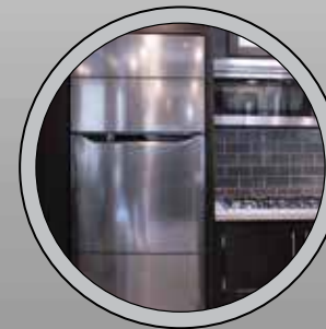
LARGE STAINLESS STEEL RESIDENTIAL REFRIGERATOR