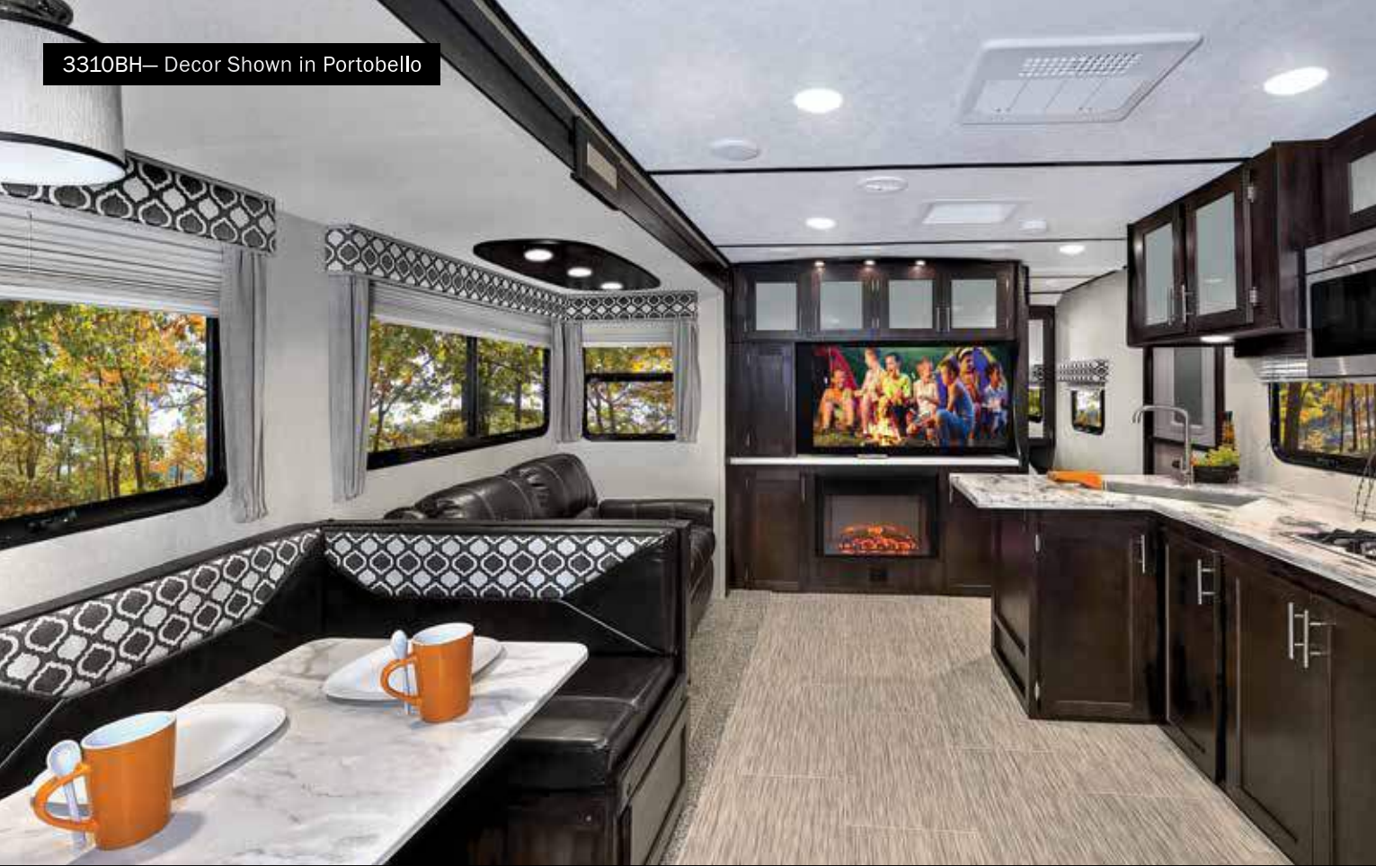
3310BH— Decor Shown in Portobello

At Prime Time Manufacturing, we know that finding the right floorplan is the single most important decision you make when purchasing your new recreational vehicle. That's why we offer a variety of choices including double and triple slide out floorplans, bunk models, rear entertainment, rear living rooms and rear kitchen models.