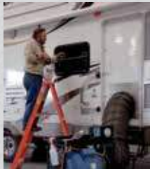
Seal Tech Air Pressure Test