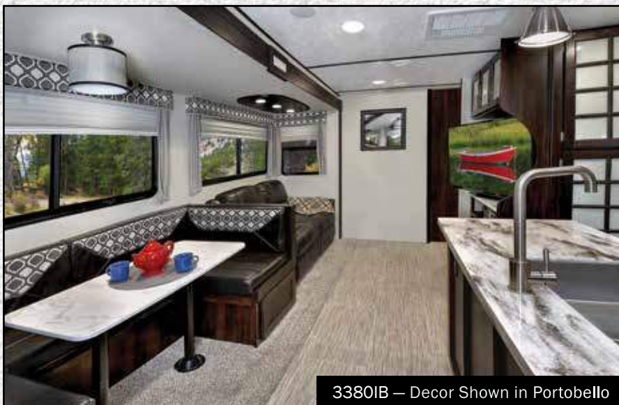
3380IB — Decor Shown in Portobello

LaCrosse simply provides a level of luxury that is a cut above.