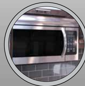
30" CONVECTION OVEN MICROWAVE