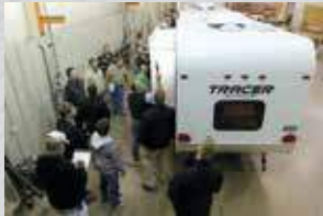
Executive Quality Audits