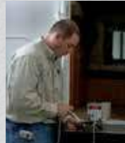
65 Point Secondary PDI