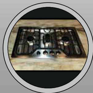
FURRION RESIDENTIAL COOKTOP