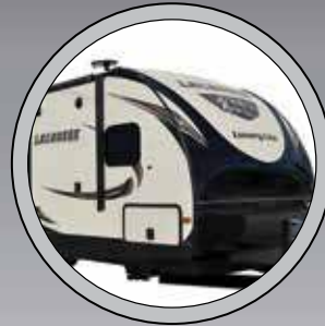
HIGH GLOSS GEL COAT FIBERGLASS