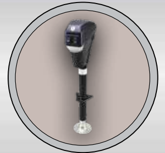
ELECTRIC TONGUE JACK